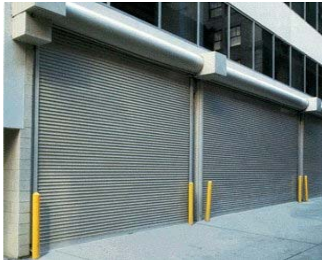
Security, overhead & rolling doors