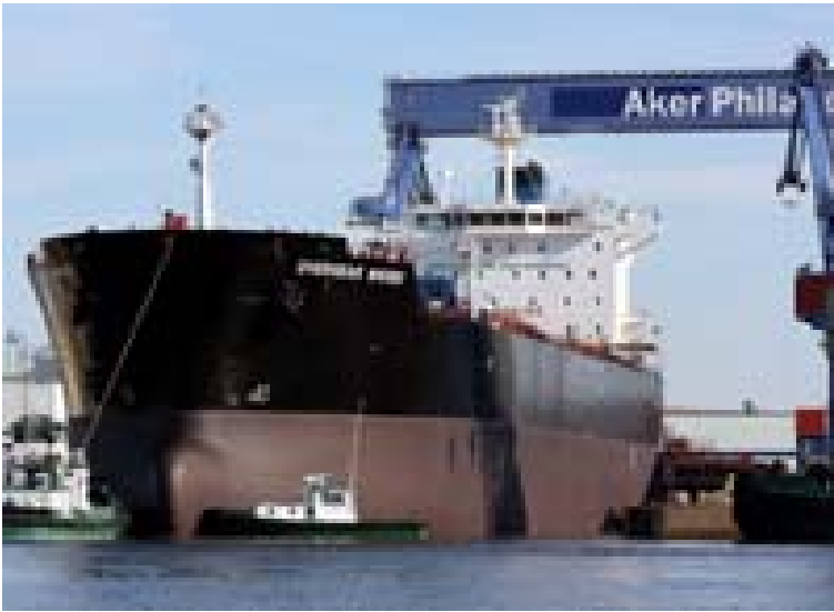
Scaffold at the Shipyard