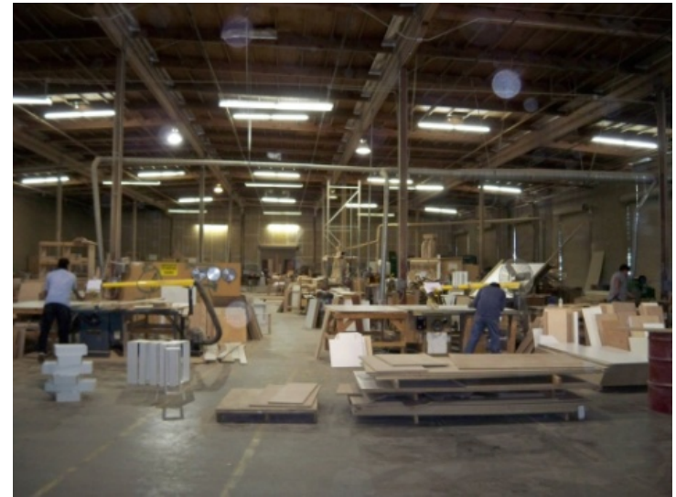
Manufacturing and Production work