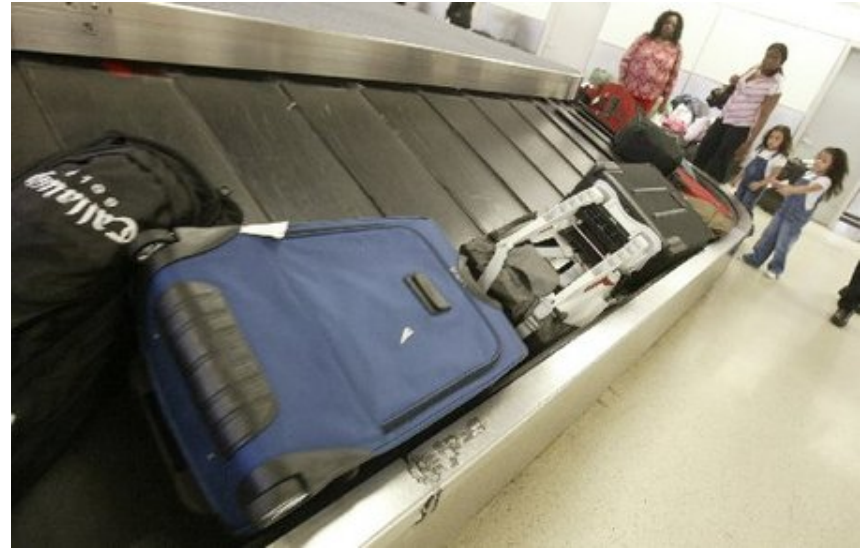
Baggage handling and equipment Maintenance at Philadelphia Airport