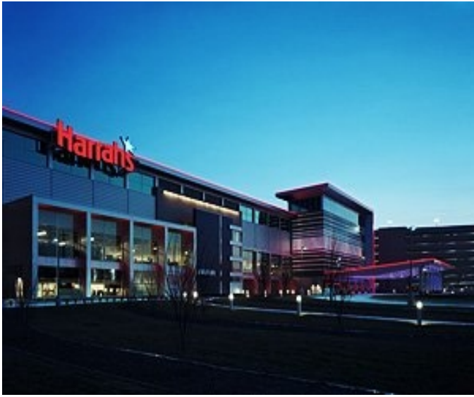
Maintenance work at Harrah's