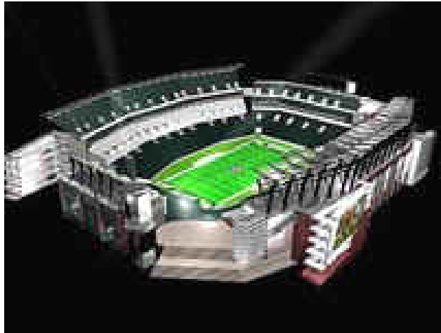
Maintenance Work at Sport complexes